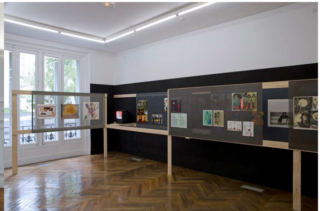
“The Second Sex - a visual footnote”, group exhibition curated by Tobi Maier (2013)